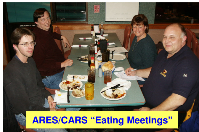
ARES/CARS "Eating Meetings"

The rains came, and swim across the lot.