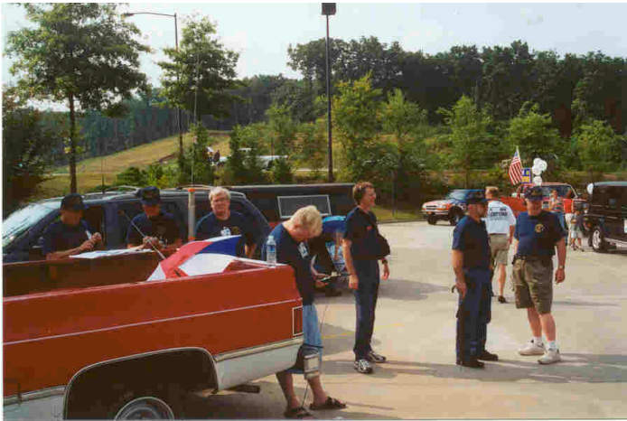
The group assembles