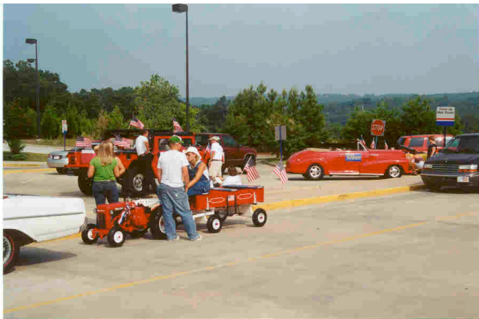
Parade participants line up